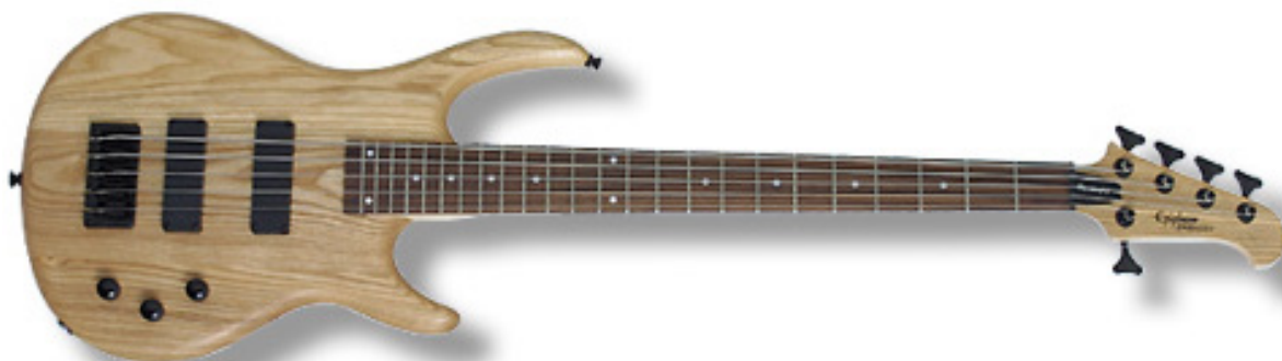
EPIPHONE EMBASSY STANDARD V